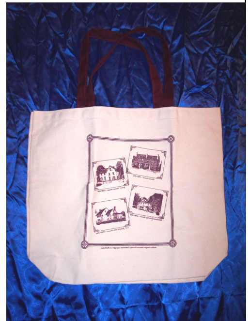
(Tote Bag- $15)