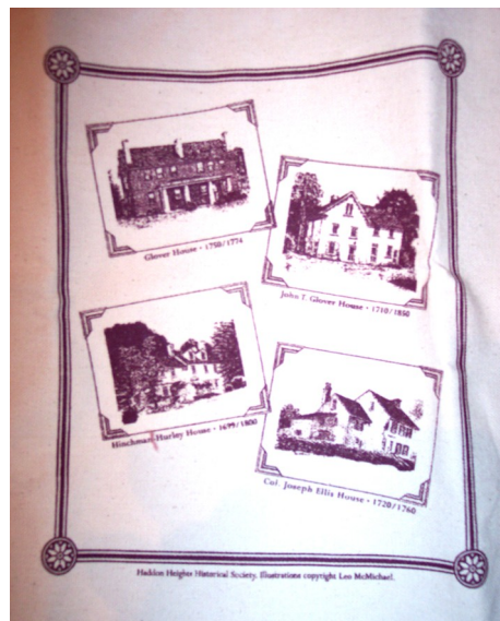
(Artwork on Tote Bag)